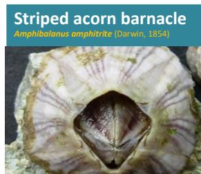
Striped acorn barnacle Amphibalanus amphitrite (Darwin, 1854)