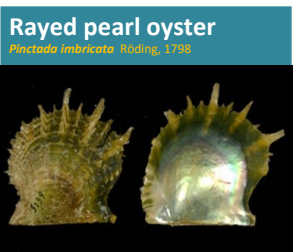
Rayed pearl oyster Pinctada imbricata Röding, 1798