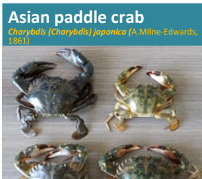
Asian paddle crab Charybdis (Charybdis) japonica (A. Milne-Edwards, 1861)