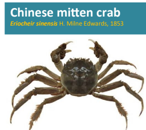
Chinese mitten crab Eriocheir sinensis H. Milne Edwards, 1853 Image: Tang et al. (2020)