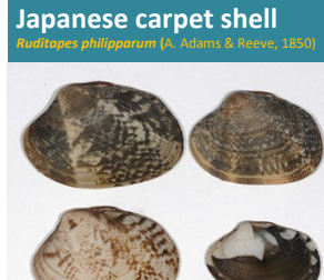
Japanese carpet shell Ruditapes philippinarum (A. Adams & Reeve, 1850)