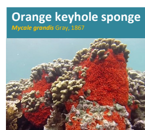
Orange keyhole sponge Mycale grandis Gray, 1867