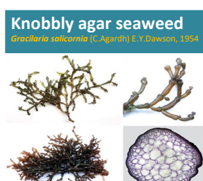
Knobbly agar seaweed Gracilaria salicornia (C. Agardh) E. Y. Dawson, 1954