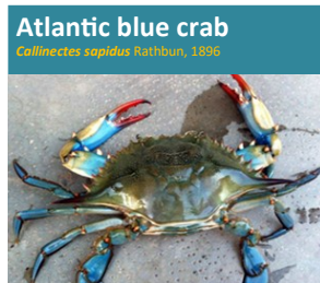
Atlantic blue crab Callinectes sapidus Rathbun, 1896