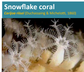
Snowflake coral Cariffoa risei (Duchassaing & Michelotti, 1860)