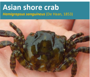
Asian shore crab Hemigrapsus sanguineus (De Haan, 1853)