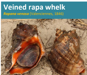
Veined rapa whelk Rapana venosa (Valenciennes, 1846)