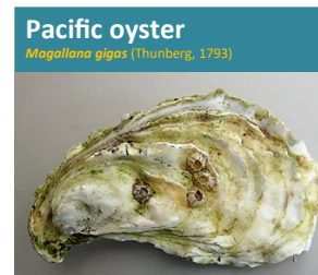
Pacific oyster Magallana gigas (Thunberg, 1793)