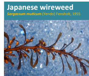
Japanese wireweed Sargassum muticum (Yendo) Fensholt, 1955