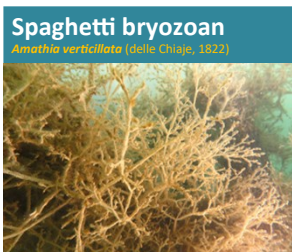
Spaghetti bryozoan Amathia verticillata (delle Chiaje, 1822)