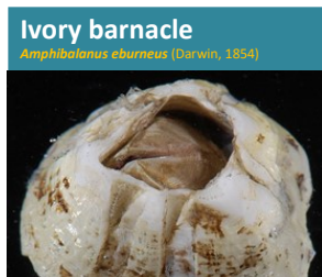
Ivory barnacle Amphibalanus eburneus (Darwin, 1854)