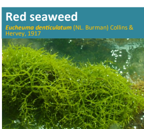
Red seaweed Eucheuma denticulatum (N. Burman) Collins & Hervey, 1917