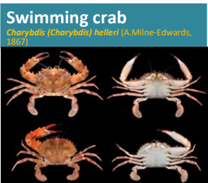
Swimming crab Charybdis (Charybdis) helleri (A. Milne-Edwards, 1867)