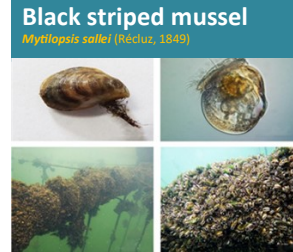
Black striped mussel Mytilopsis salter (Recluz, 1849)