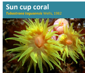
Sun cup coral Tubastraea tagusensis Wells, 1982