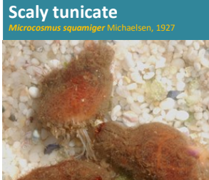
Scaly tunicate Microcosmus squamiger Michaelsen, 1927

These are the top 25 marine non-indigenous species of concern identified for the Pacific island countries and territories. For more information please see the SPREP website.