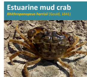
Estuarine mud crab Rhithropanopeus harrisii (Gould, 1841)