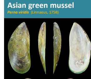
Asian green mussel Perna viridis (Linnaeus, 1758)