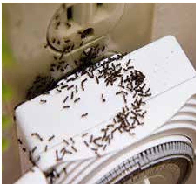
Ants damaging electric infrastructure