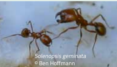
Solenopsis geminata

Invasive ants are a diverse group of aggressive, competitive, dominating ant species that can rapidly establish and spread. Several ant species are amongst the most serious global invasive species. Their broad diets, nesting habits, ability to breed rapidly, high densities and adaptability to varied habitats make them excellent invaders. Agricultural, economic, environmental and social wellbeing are threatened by these ants, many of which have been introduced to, and established in, many countries.