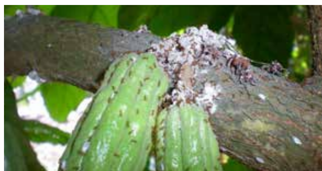
Wasmania auropunctata foraging on crops

Many methods are used to find invasive ants at high risk locations, including visual inspections, regular use of baits and lures and odor detector dogs.