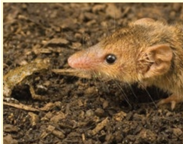
Native mammals like this planigale have an aversion to eating toads.