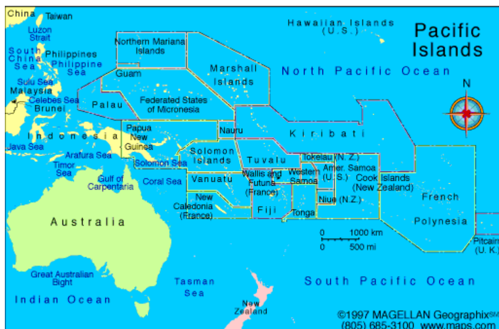
Figure 1: General Map of the Pacific Region and its States and Territories